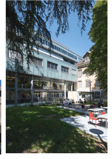
Département des finances Direction générale des finances de l'Etat