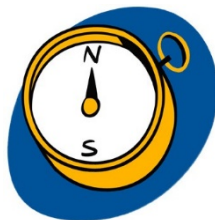
Personalised advice in secondary school