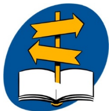
Handbooks on training and professions in school

Refer to the information and annexes below; discuss and share with your child, his careers adviser and secondary school teachers, direct contacts guiding the pupil in his choice.