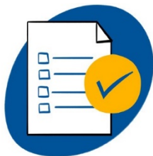
Conditions for admission