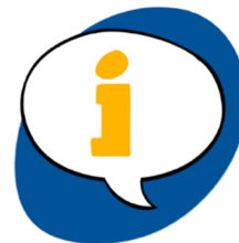
Information sessions and open days