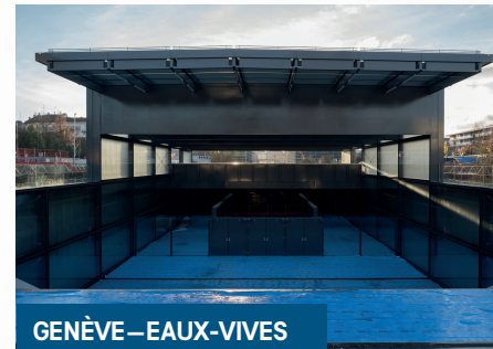
GENÈVE – EAUX-VIVES