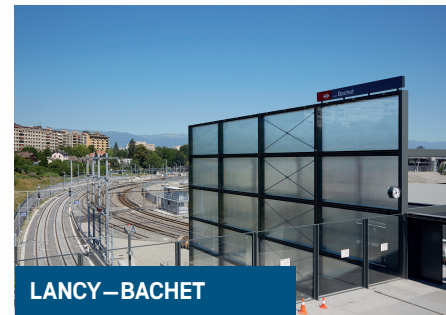
LANCY – BACHET

In the following pages, you will find information on travel times, ticket prices, station organisation and their surroundings. You can also find useful telephone numbers and websites to learn more about the new urban and regional train network that will be put into service on 15 December 2019, such as the many travel options it offers and to see how the Léman Express can improve your daily life.