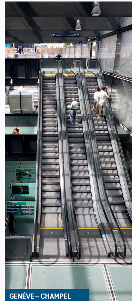
GENÈVE – CHAMPEL