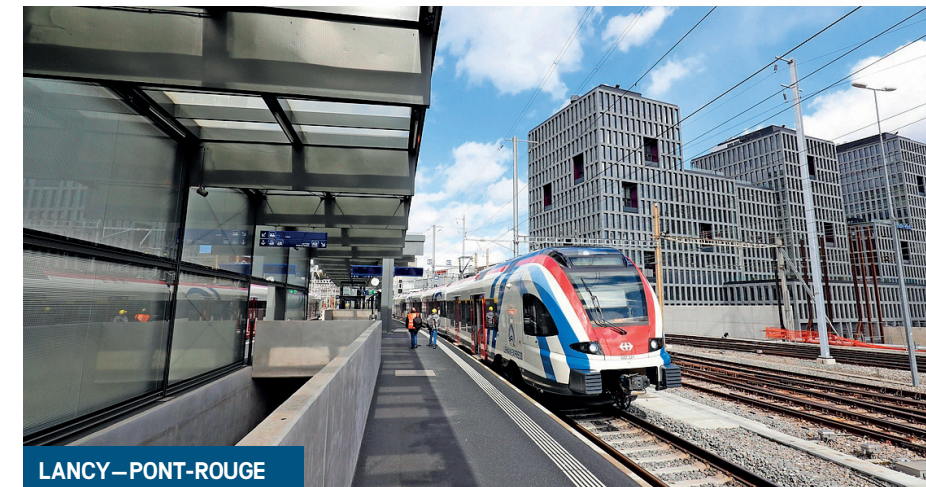
LANCY – PONT-ROUGE

At Lancy-Pont-Rouge, Lancy-Bachet, Geneva-Champel, Geneva-Eaux-Vives and Chêne-Bourg, five new stations will welcome the Léman Express in the heart of the city